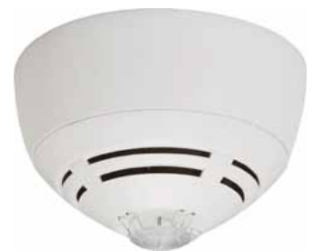
Wireless gateway with IQ8Quad detector