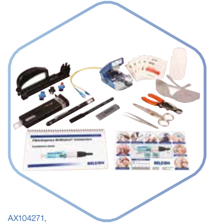
AX104271, Precision Installation Kit