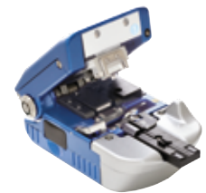
AX104286, Precision Cleaver