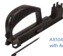
AX104276, Support Handle with Adapters