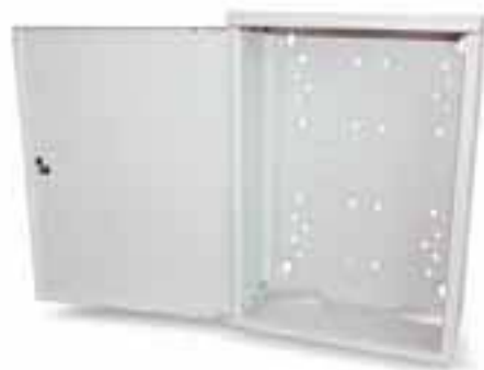
Fig. 1: FO wall mount distribution box OV-W