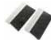
Fig. 3: Bürstenleisten-Set