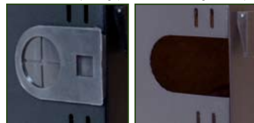
Rear cable opening (with and without grommet)