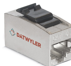
RJ45 Keystone Coupler (RJ45-RJ45), 180°, straight