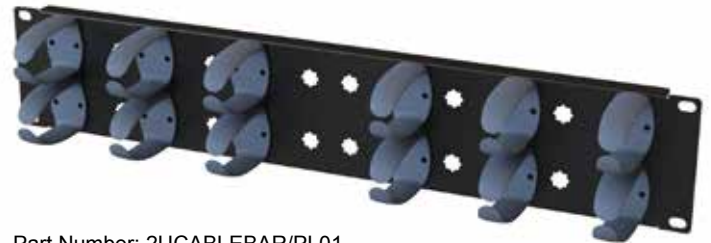
Part Number: 2UCABLEBAR/PL01