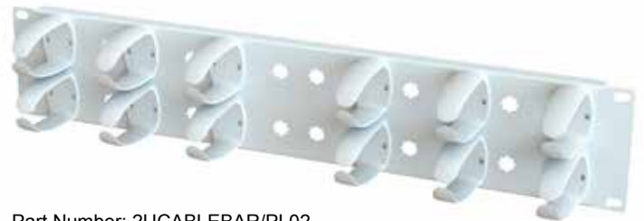
Part Number: 2UCABLEBAR/PL02