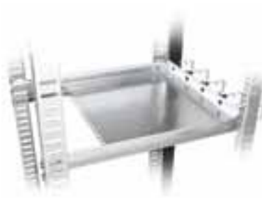
19" cable shelf with management panel