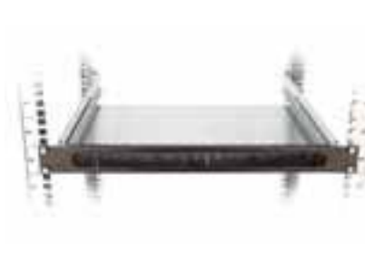
19" cable shelf with cable feedthrough panel and strip