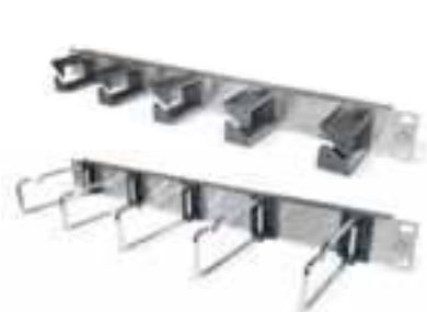
Management panel 19" 1U, version made of stainless steel, with 5 support brackets