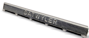
Splice protector, crimp